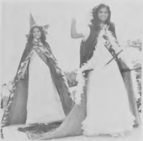
Caiquetio Club Queens